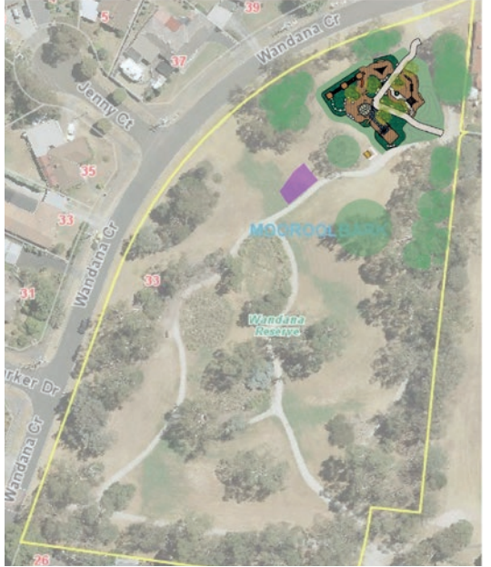
Option 2: South