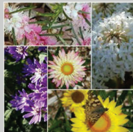
Butterfly attracting plants