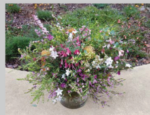
Floral display by Shelley Graham