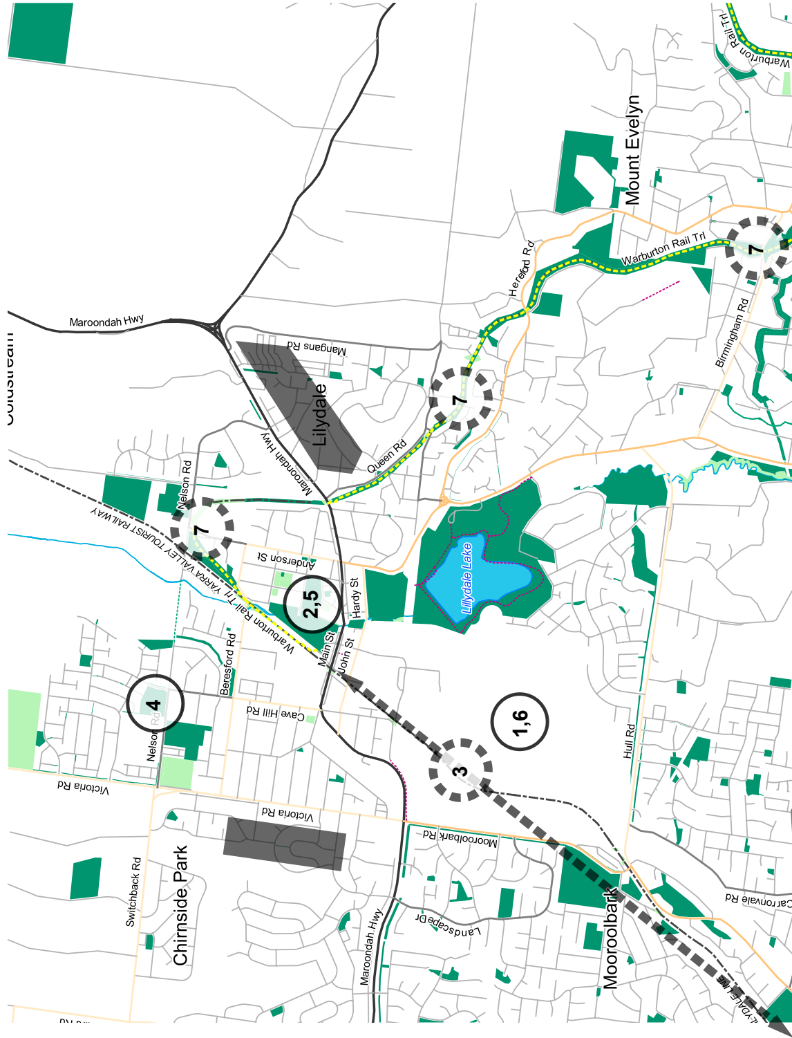
Precinct C Recommendations Lilydale