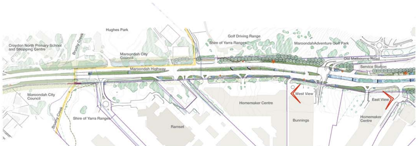
Proposed Concept Plan for the Green Spine -Maroondah Highway from Brushy Creek to Manchester Road