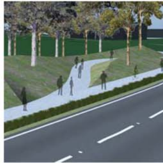
Integrated art and landscape An artistic impression of possible integrated art and landscape, showing the shared path moving through a cutting, besides WSUD planting.