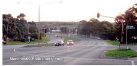
Manchester Road Intersection

The Shire of Yarra Ranges is located in Melbourne's outer East. Its character changes from urban to rural and bush settings. The area of the 'Green Spine' Project is along Maroondah Highway from Brushy Creek near Croydon North Shopping Centre, to Manchester Road, next to Chirnside Park Shopping Centre.