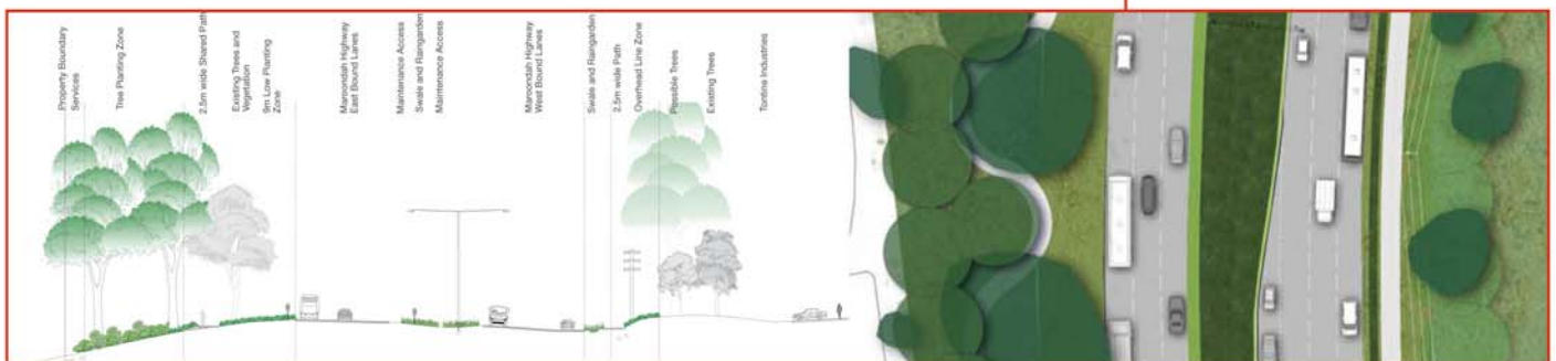
Typical Area 1 - Chimside Park and Tontine