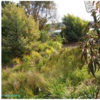
Water Sensitive Urban Design (WSUD) A typical image of planting in a raingarden.