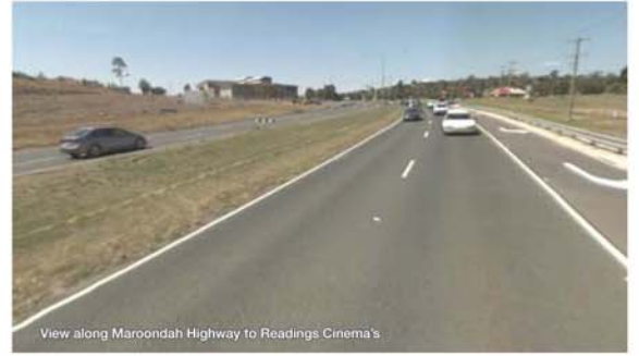
View along Maroondah Highway to Readings Cinema's