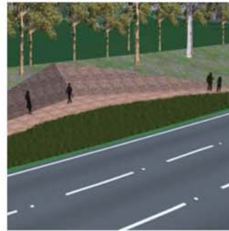
Integrated art and landscape An image of possible integrated art and landscape, showing the shared path moving along side a constructed room and WSUD.