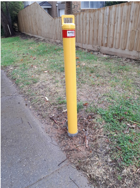
(images are illustrative only and do not override other information provided)