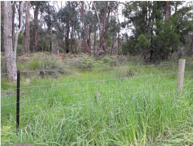
(images are illustrative only and do not override other information provided)