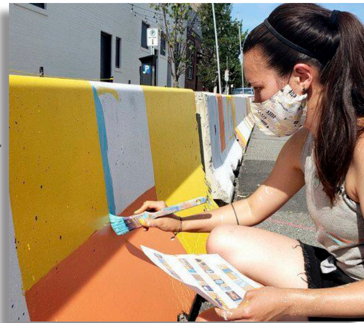
Painted Jersey Barriers