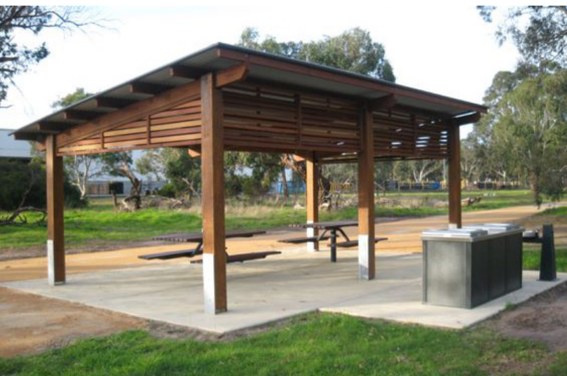
Future Shelter Zone