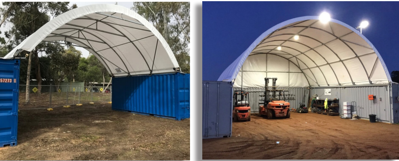
Shipping Container Storage Space