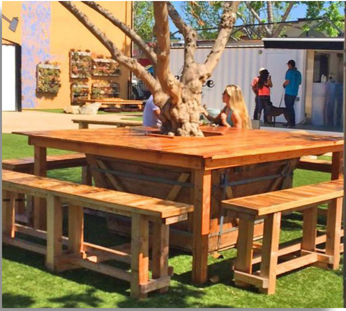
Outdoor Seating Area