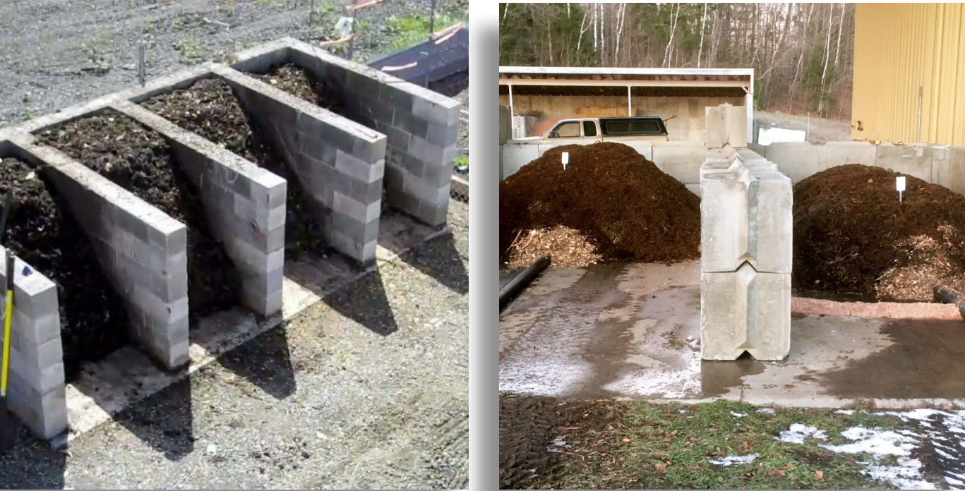
Composting Zones/Materials Bay/ Organics Area

With the completion of the multilevel car park that supports the Mooroolbark Station, the car park at the corner Charles and Station Street has become redundant and represents an opportunity for the creation of an exciting pop-up activity center. This concept aims to activate the space with a large community garden space, fruit tree forest, community composting zone and shipping container storage zone amongst other activity and leisure areas.