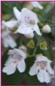
Victorian Christmas Bush or Prostanthera lasianthos