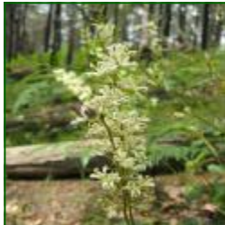
Tree Lomatia or Lomatia fraseri