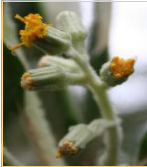
Blanket Leaf, Bedfordia arborescens